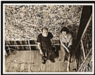
Jackson Pollock and Lee Krasner in Pollock's studio, ca. 1950. Black and white photographic print, 13 x 16 cm. Jackson Pollock and Lee Krasner papers, circa 1905-1984.

The book Speaking of Art: Selections from the Archives of American Art Oral History Collection (1958-2008) celebrates the 50 th anniversary of the Archives of American Art's oral history program with excerpts from some of the Archives' most fascinating interview transcripts. Sculptor Isamu Noguchi recalls his