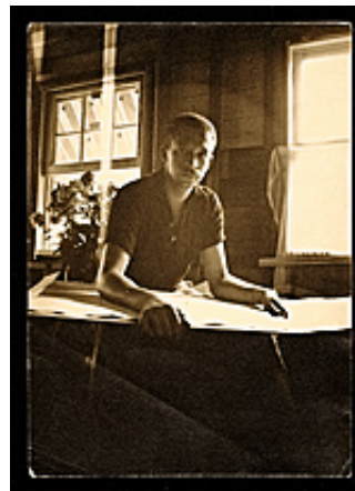
Charles Henry Alston at work in his studio, circa 1937. Albumen photograph, 18 x 13 cm. Unidentified photographer. Charles Henry Alston papers, 1928-1980. Archives of American Art, Smithsonian Institution.