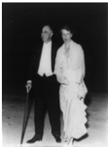
Governor and Mrs. Roosevelt, dinner guests of President Herbert Hoover, at the White House, April 28, 1932.

I found that the Democratic and Republican candidates, Roosevelt and Herbert Hoover, had been friends during the Woodrow Wilson administration, and had briefly entertained the notion of a Democratic Hoover-Roosevelt ticket in 1920, before Hoover declared himself a Republican. By 1932 they had become bitter rivals, barely talking to each other on the way to Roosevelt's inauguration. One instance that proved particularly telling demonstrated the value of oral history when combined other documentary sources.